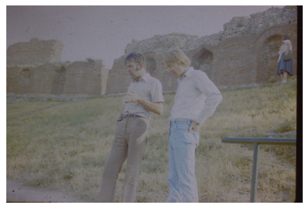
Figure 1. Dziembowski and Goode in 1983 in Catania.

In the early 1990s, we did our most mathematically pure work on stellar oscillations in which we developed a complete formalism, valid through second order in differential rotation ( \Omega(r, \theta) ), describing the effect of rotation on stellar oscillation frequencies (Dziembowski and Goode 1992). We found that second order effects on solar oscillations